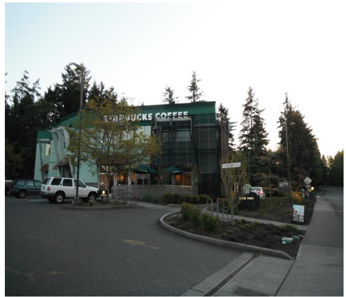
Entryway Scaffold setup typical. Netting wrapped inside to wall.