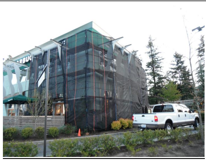
Drive through side from street with shrink wrap installed