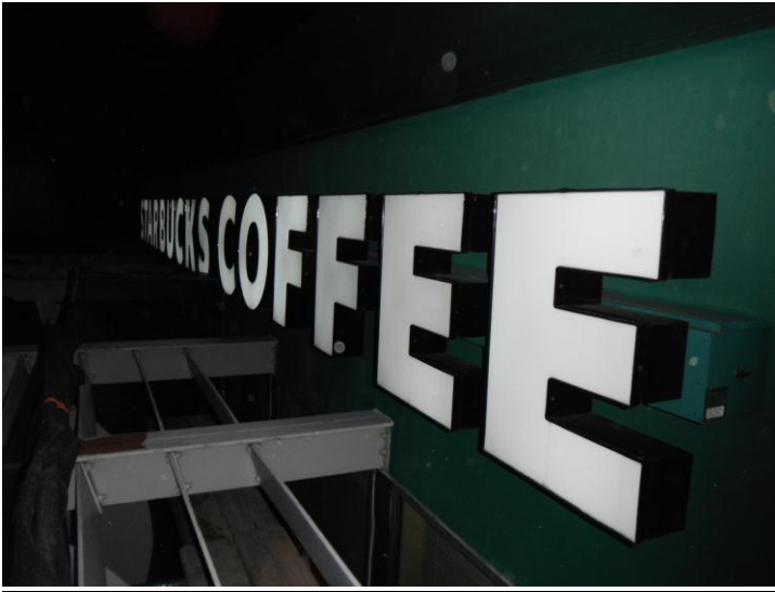
This COFFEE portion of the sign will be removed next week