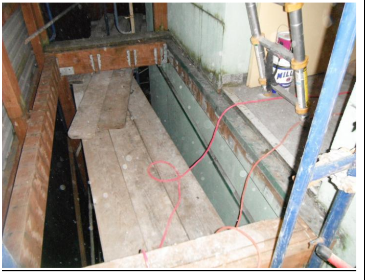
Decking boards removed and stored inside L2 to facilitate work