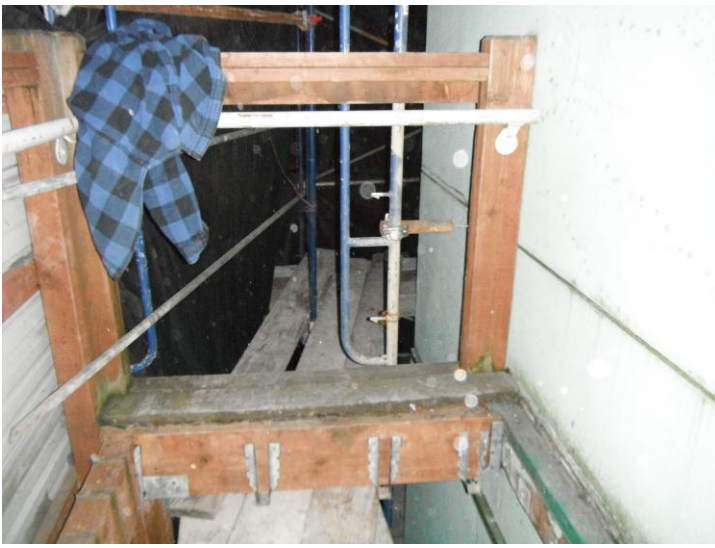
Metal panel removed to facilitate work. Salvaged materials stored inside L2