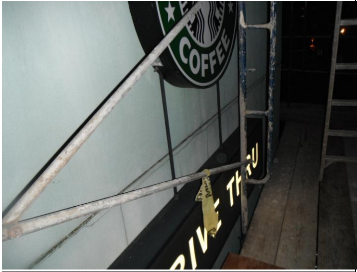
These signs on South Elevation will be moved next week